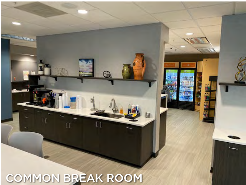
COMMON BREAK ROOM