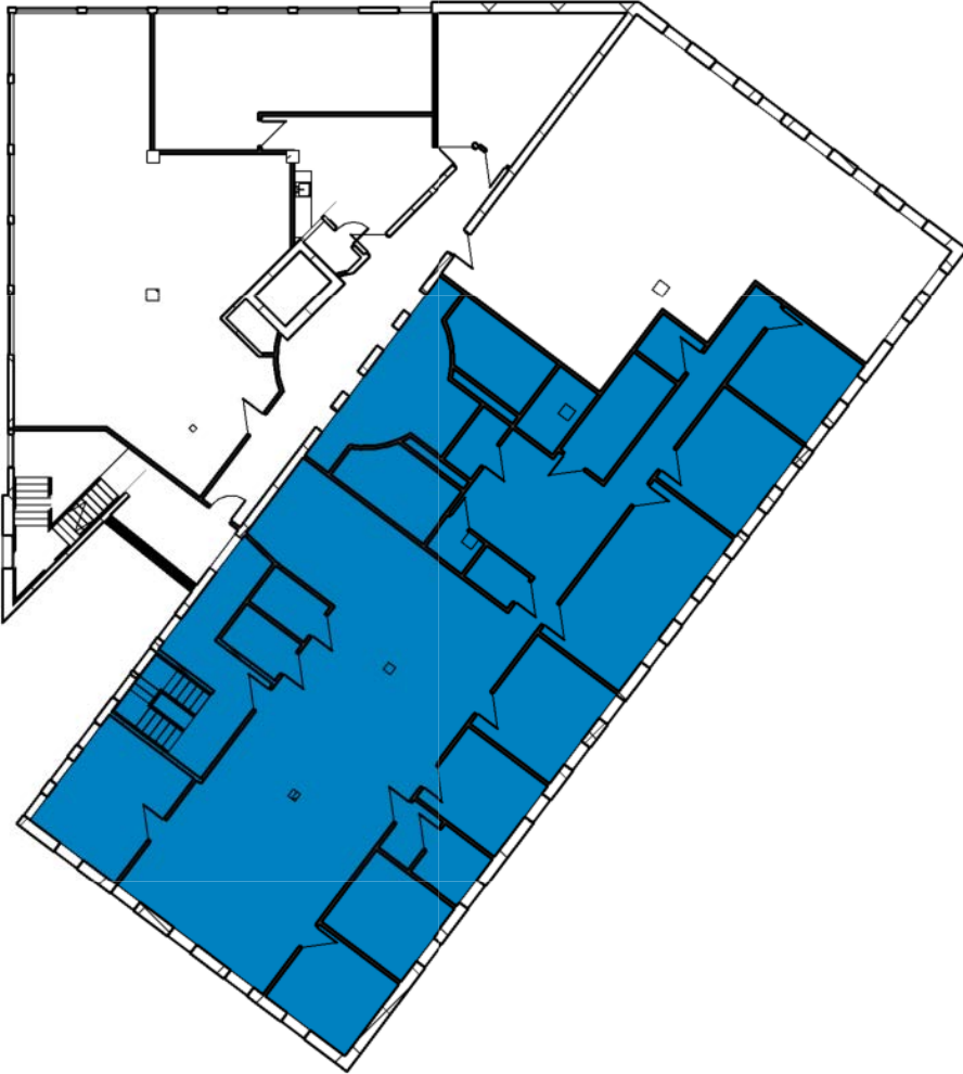
SUITE 301 4,068 SF