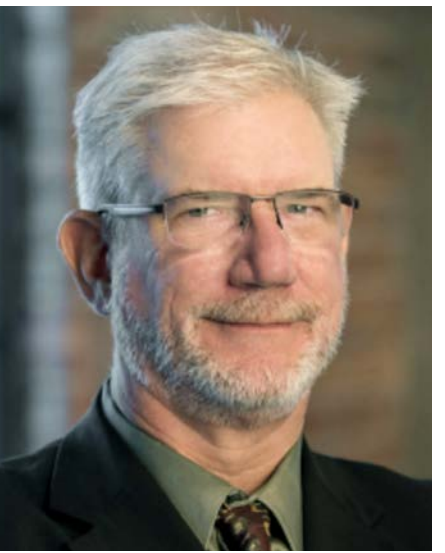
DOWNTOWN COUNCIL OF KC - SUBMITTED Bill Dietrich

The core function of the downtown area has changed from industry to office, and now it's changing from solely office to a mixed-use environment. Richard calls the office market pre-COVID one of the last vestiges of the Industrial Age. We used to stack people in factories, and then we offshored the factories. Next we stacked people in office buildings, and now we're evolving