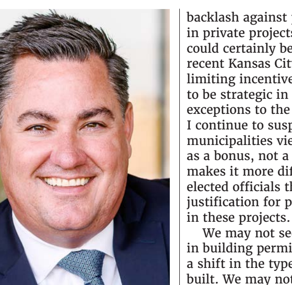
COUNTRY CLUB BANK - SUBMITTED